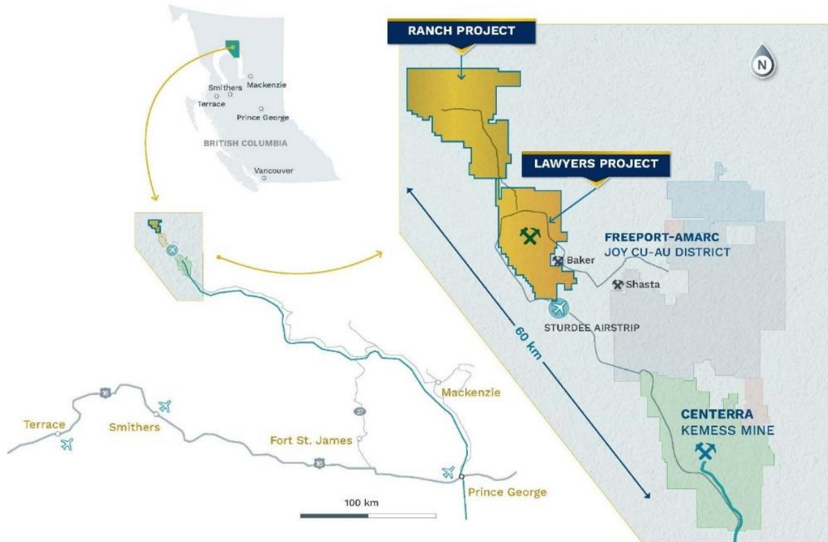
Figure 1: Regional map showing the locations of the Ranch and Lawyers projects.

Excellent infrastructure allows for both air and vehicle access to the Ranch and Lawyers Projects (Figure 1). The Sturdee Airstrip is immediately south of the Lawyers Project and allows for regular flights from regional airports in Prince George, Terrace, and Smithers, BC. Ranch is road-accessible by way of the Lawyers project via the recently upgraded Ring Road, which circumnavigates the Lawyers property and allows for low elevation access to both projects. Lawyers is situated 45 km northwest of the Kemess gold-copper mine, a viable tie-in point to a hydroelectric power grid (BC Minfile No. 094E 094).