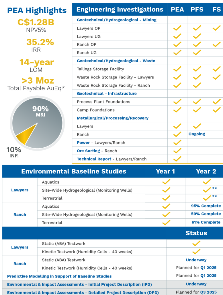
Figure 3: Project progress to-date.

*AuEq – gold equivalent calculates at 80:1 silver to gold